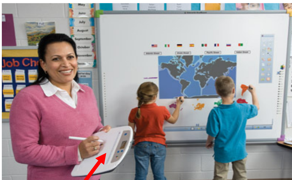
Interwrite MOBI Wireless Notepad

Hundreds of schools across Alabama are using eInstruction's Award Winning Technology to engage students, get feedback & improve results. Proven to increase learning and AYP! Many schools are taking advantage of stimulus funds to implement across all grade levels. Professional Development available to help teachers integrate technology with curriculum.